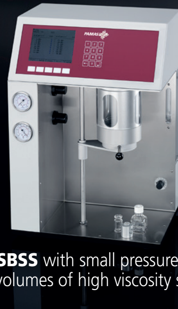
PAMAS SBSS with small pressure container for small volumes of high viscosity samples