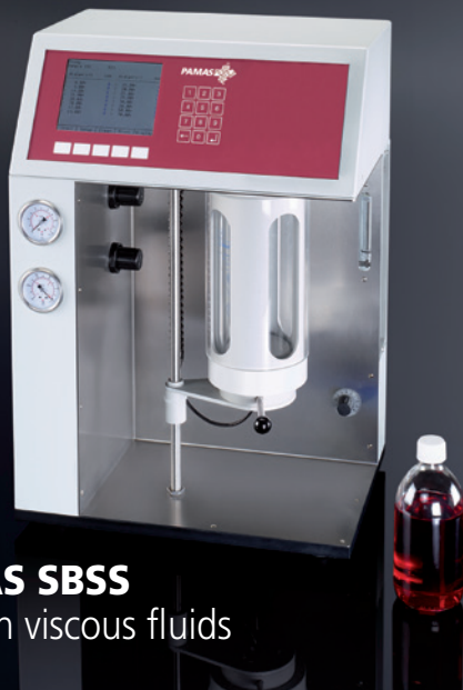
PAMAS SBSS for high viscous fluids