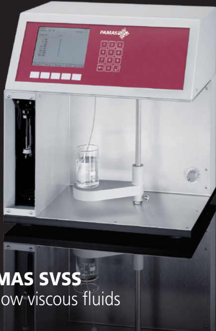
PAMAS SVSS for low viscous fluids