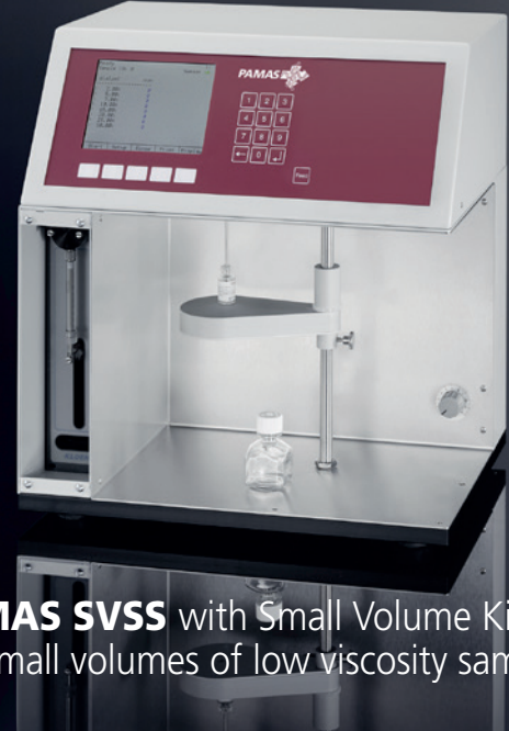
PAMAS SVSS with Small Volume Kit for small volumes of low viscosity samples