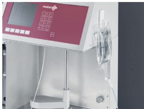
Accessories for infusion solutions

For the analysis of low viscous pharmaceutical infusion solutions, PAMAS offers the SVSS, a versatile, highly flexible particle counter. The height adjustable sample stage allows for the use of a wide variety of sample containers and is equipped with a magnetic stirrer to ensure the fluid remains homogenous. In a few simple steps the SVSS can be adapted for the measurement of the smallest sample volumes down to 100 µl. To avoid the critical and time-consuming decanting of samples, a special kit that enables samples to be taken directly out of infusion bags is also available as an option.