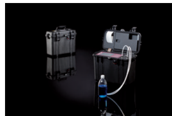
Rugged case PAMAS GO

All versions are optionally available in the robust PAMAS GO housing.